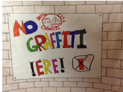
Y5 'Where am I? Local Study' (Ashley)